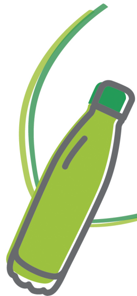
WIEDERBEFÜLLBARE TRINKFLASCHE BOTTIGLIA RIEMPIBILE REFILLABLE WATER BOTTLE