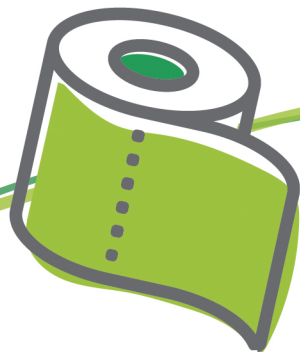
KLOPAPIER CARTA IGIENICA TOILET PAPER